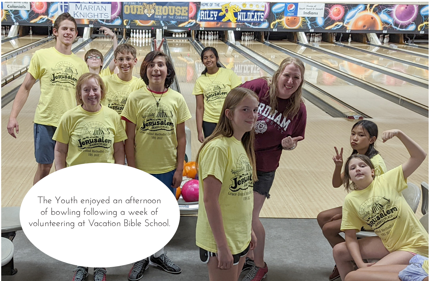
The Youth enjoyed an afternoon of bowling following a week of volunteering at Vacation Bible School.